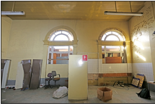
0227 G06 W wall