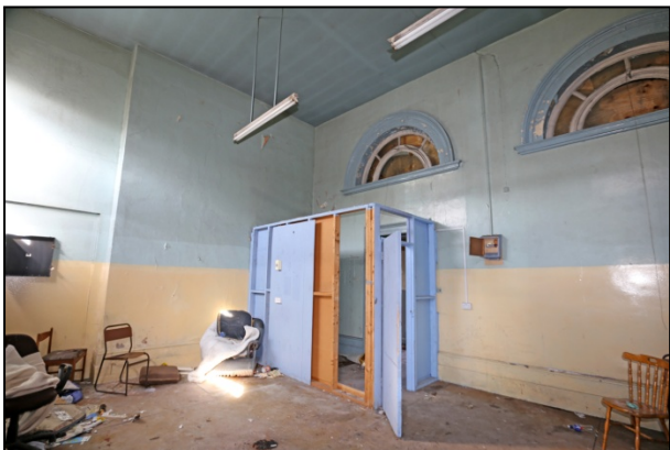
0231 G07 to NE