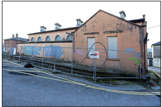
0204 E elevation from NE