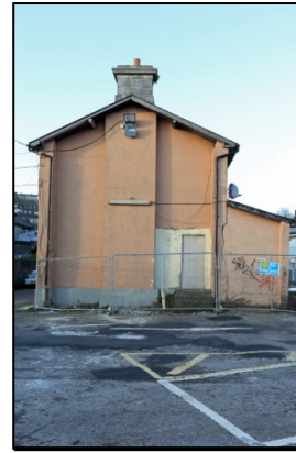
0210 S gable