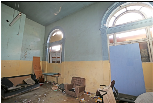
0229 G07 to SW