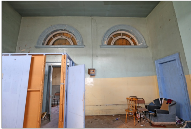
0233 G07 E wall