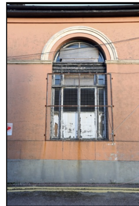
0214 W elevation window detail