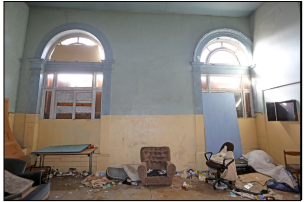
0234 G07 W wall