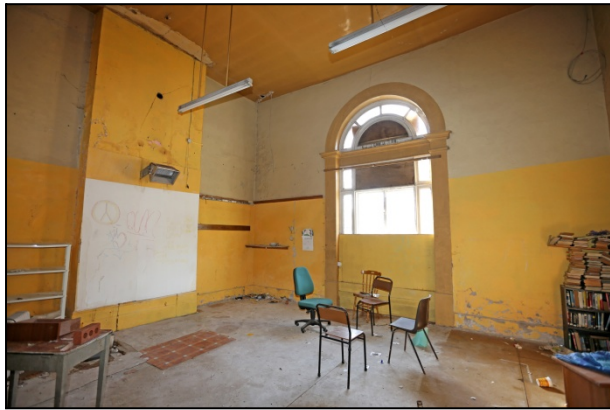
0235 G08 to SW