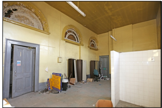
0224 G06 to SE