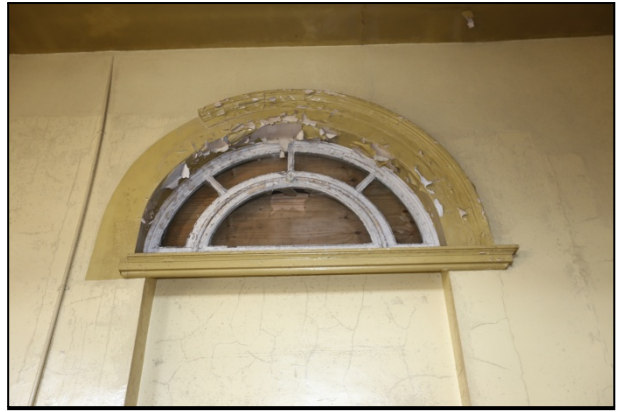
0226 G06 E wall window detail