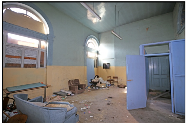
0230 G07 to NW