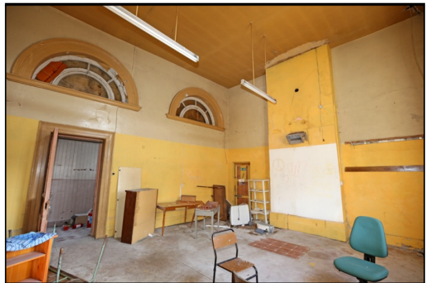
0238 G08 to SE