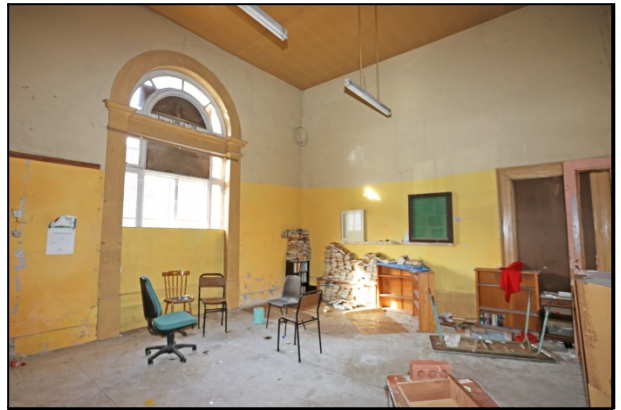
0236 G08 to NW