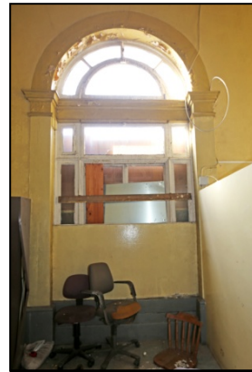
0228 G06 W wall window detail