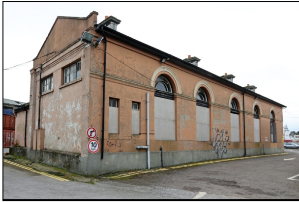
0201 Bld 2 Passenger station from NW