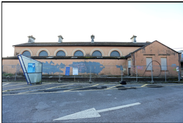
0205 E elevation