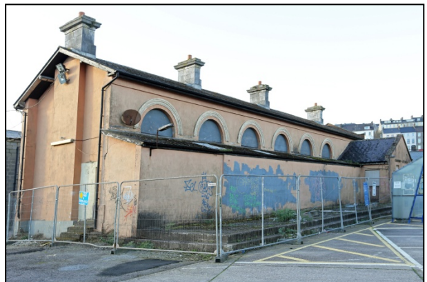
0208 E elevation from SE