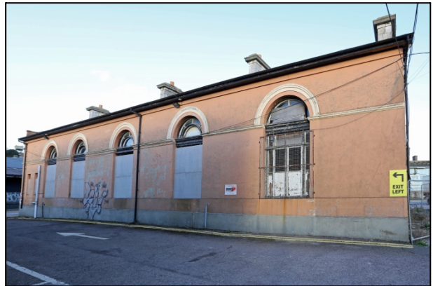
0212 W elevation from SW