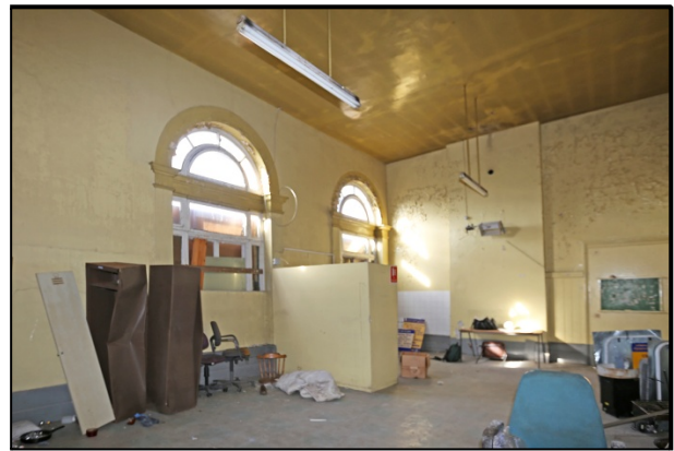
0222 G06 to NW