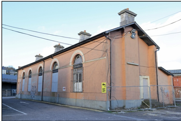
0211 From SW