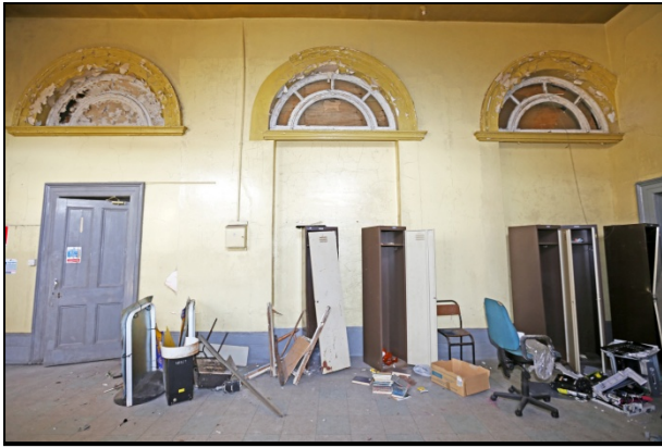
0225 G06 E wall