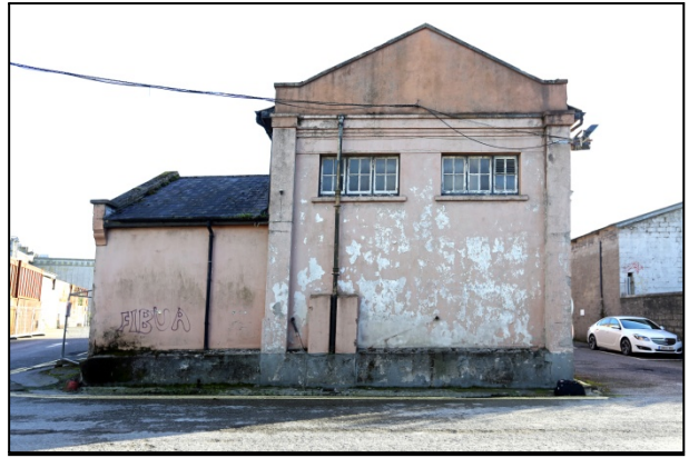
0202 N gable