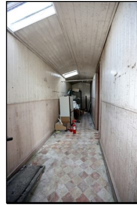
0218 G05 to S from middle