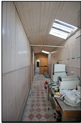
0219 G05 to N from S end