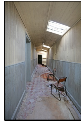
0220 G05 to N from middle