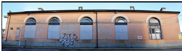
0213 W elevation