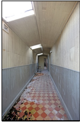
0217 G05 to S from N end