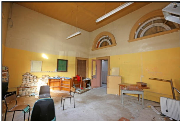
0237 G08 to NE