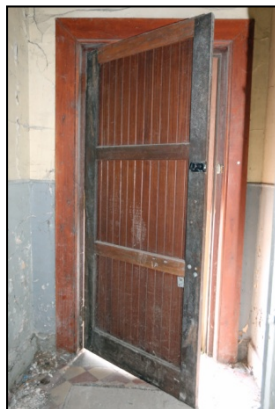
0215 Bld 2 interior G01 to S