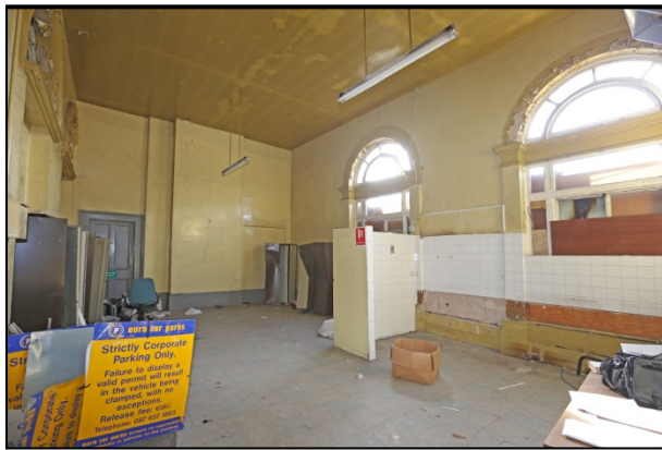
0221 G06 to SW