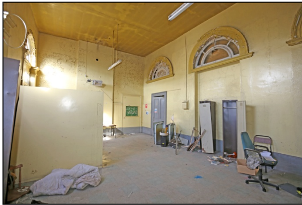
0223 G06 to NE