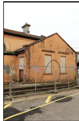
0206 Porch at NE end, from SE (1)