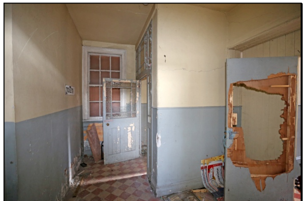
0216 G02 to E