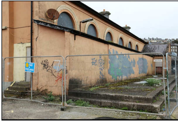
0209 Lean-to along E side, from SE