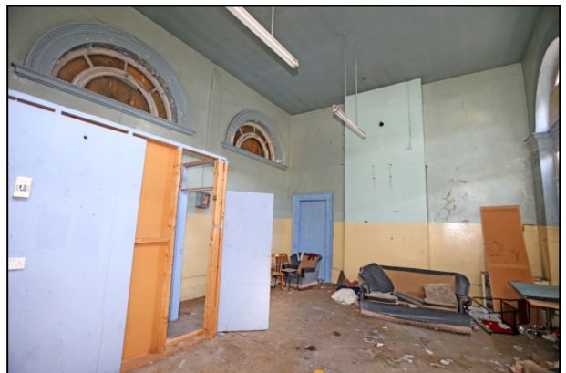
0232 G07 to SE