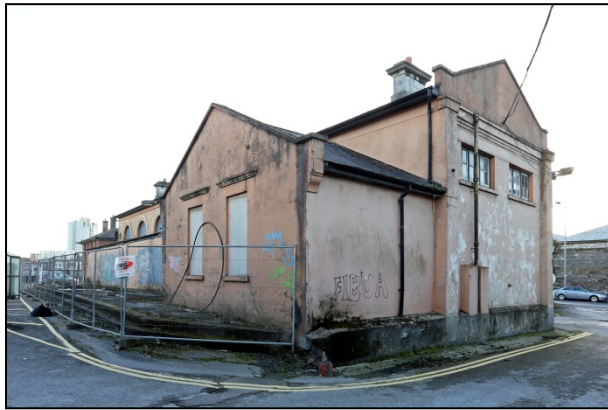
0203 From NE