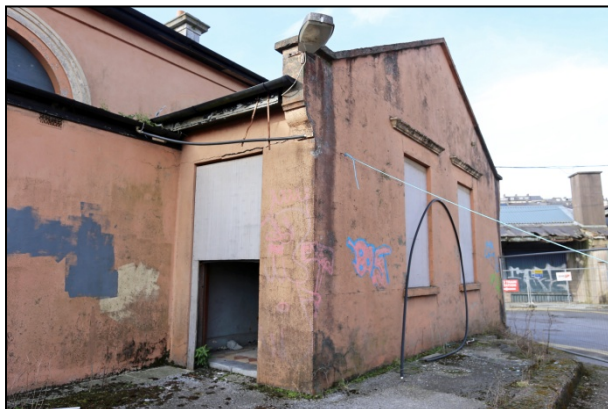
0207 Porch at NE end, from SE (2)