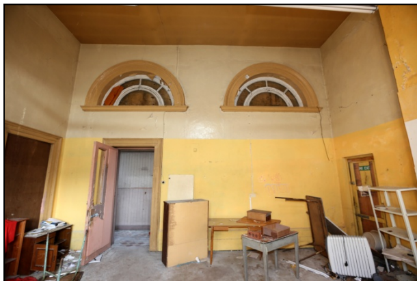
0239 G08 E wall